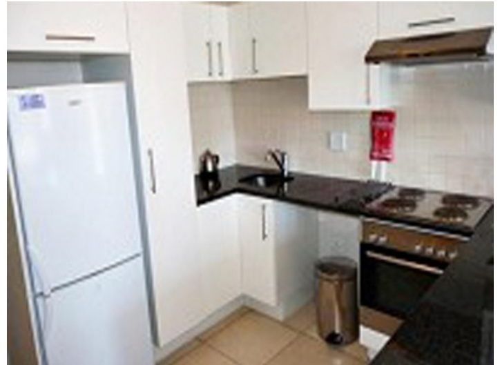
Spacious kitchen area with big fridge