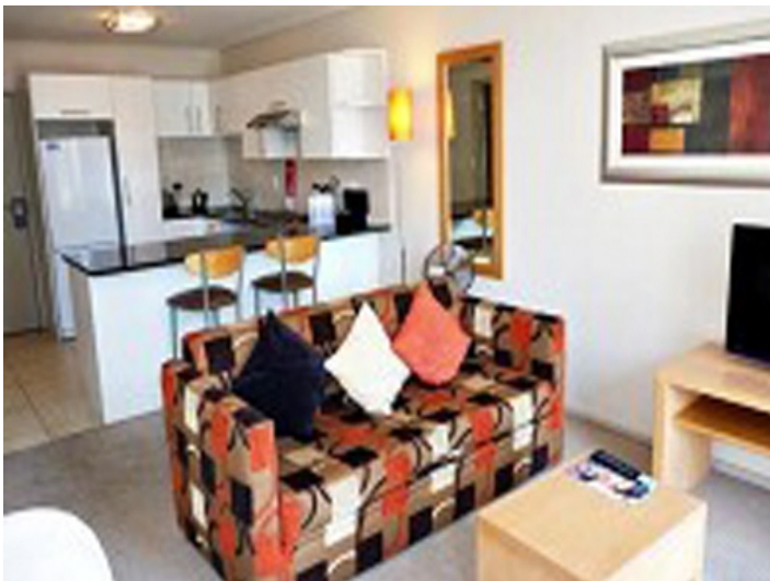
View of the living area