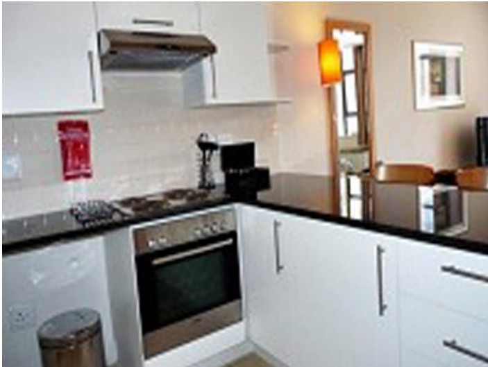
Nice and cozy kitchen