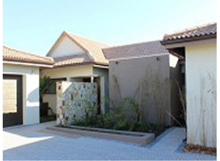
Property view from the inside area