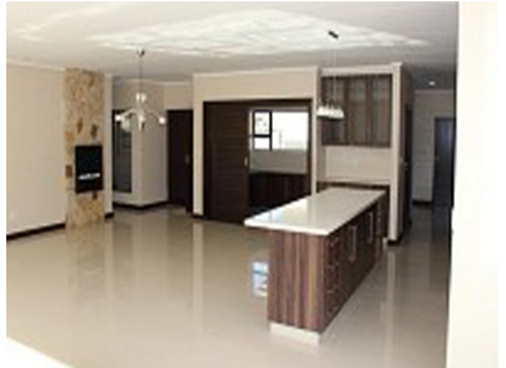
American style kitchen area