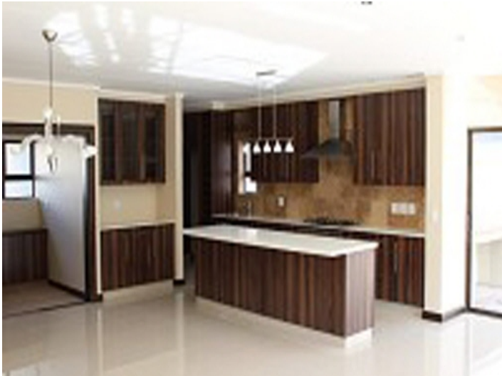
New spacious kitchen