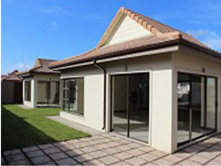
Huge outside patio area