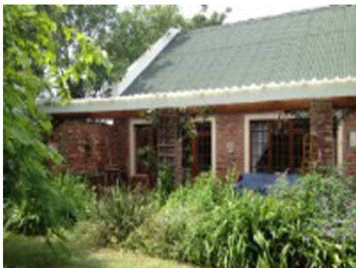
General house view