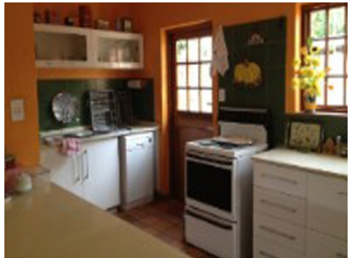
Well equipped kitchen