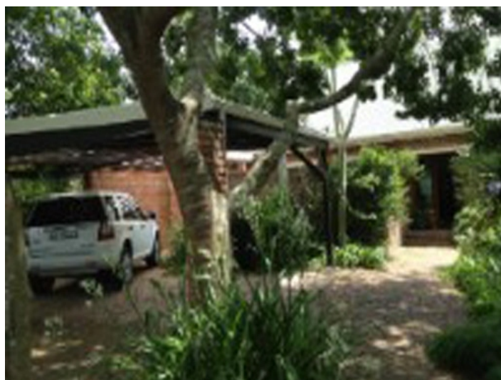
Carport available for 2 cars