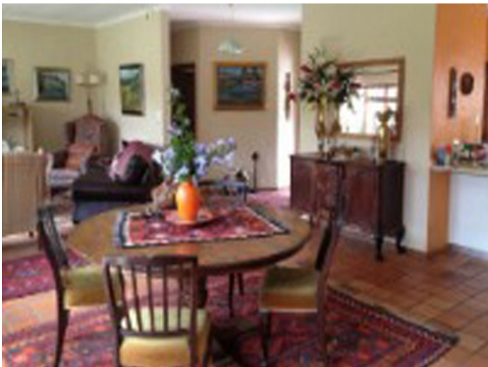
Spacious dining room