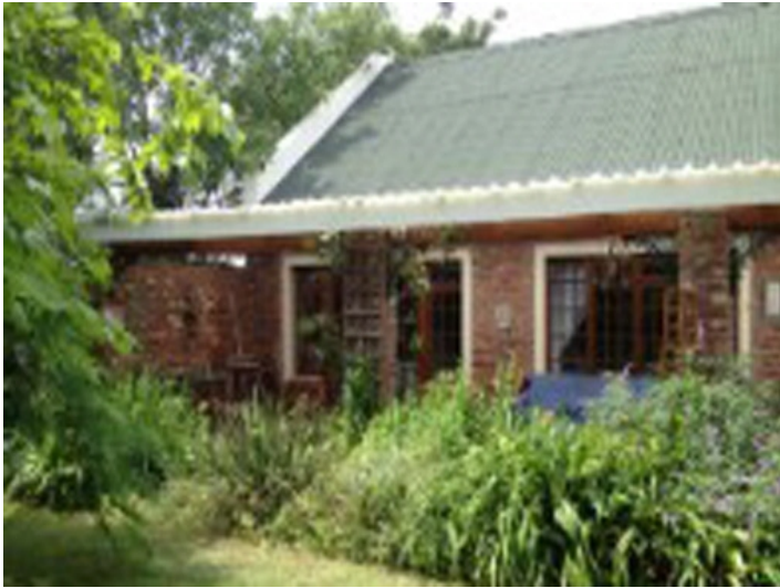
General house view