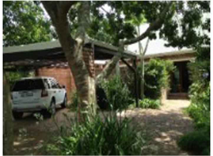
Carport available for 2 cars