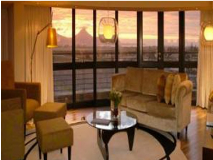
Luxurious living area in the penthouse