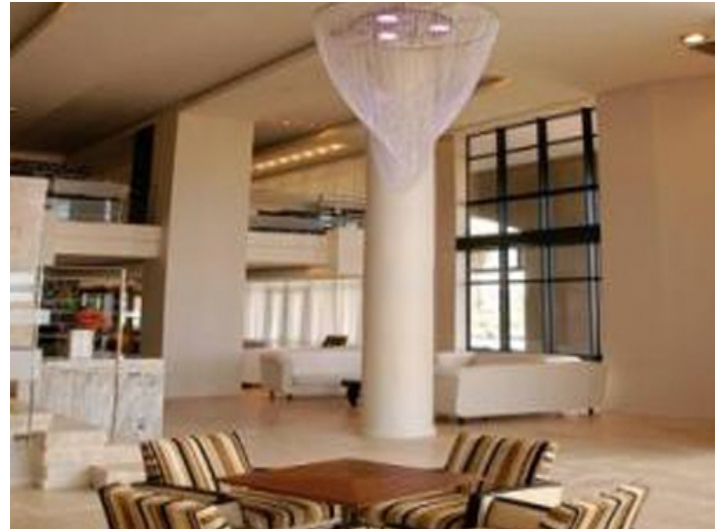
Bright and spacious hall