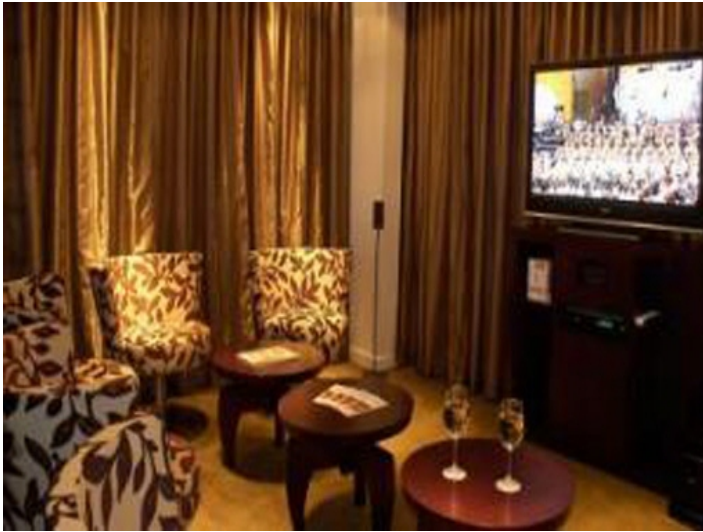
Huge and comfortable TV area