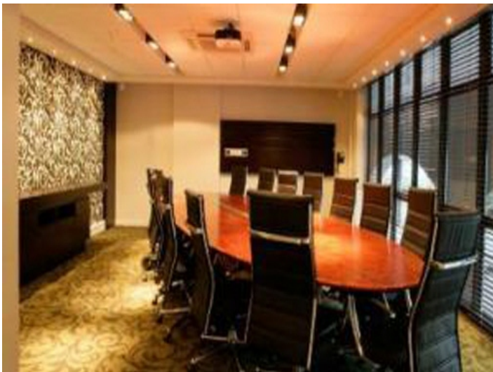
Boardroom available in the Colosseum Hotel