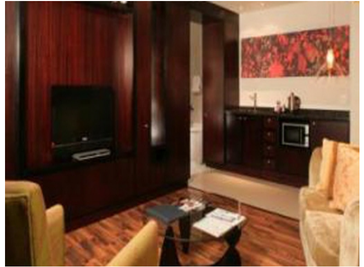
Posh living area in the building